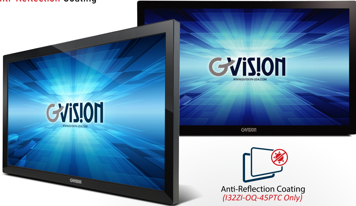
Anti-Reflection Coating (I32ZI-OQ-45PTC Only)