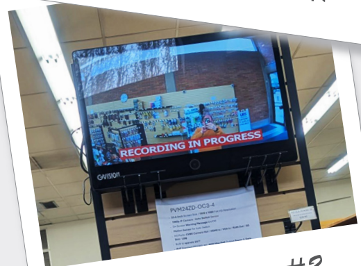
Hardware Store #2