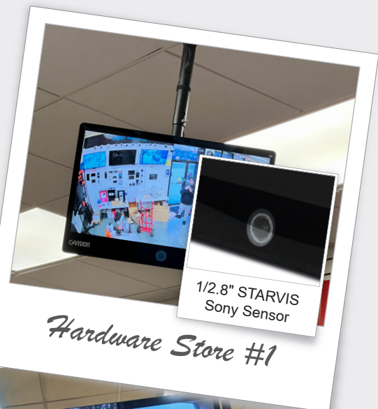
Hardware Store #1